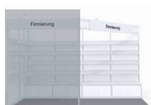
Example image CORNER STAND, 4 m 2