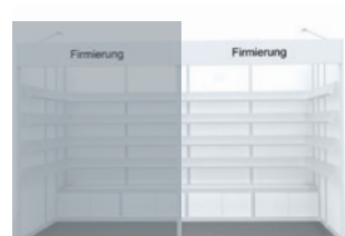
Example image ROW STAND, 4 m 2

Hand in hand: Do you and another publisher or a fellow industry professional complement each other in terms of content? Can you imagine exhibiting together? Our DUO VERSION makes it possible. Shared panel signage attracts attention whilst also creating scope for synergies. Ideal for sharing the burden of a trade fair presence as a pair!